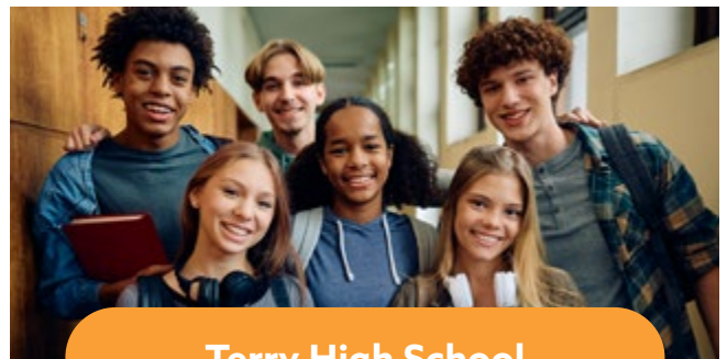
Terry High School

7TH-8TH GRADE 4601 Airport Road Rosenberg, TX 77471