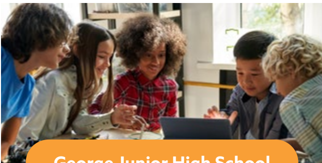
George Junior High School

6TH GRADE 4700 Avenue N Rosenberg, TX 77471