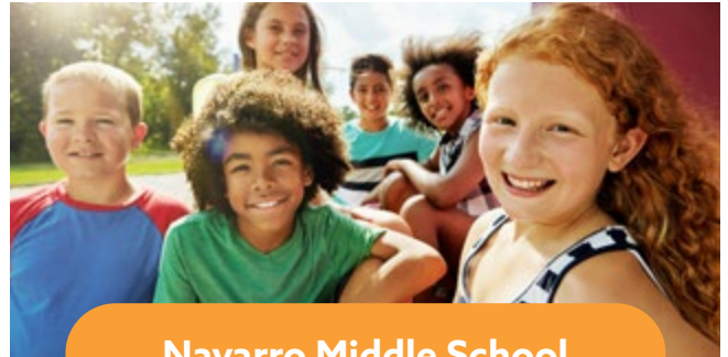
Navarro Middle School

KINDER-5TH GRADE 7511 Avenue J Beasley, TX 77417