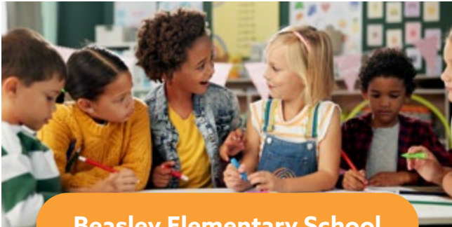
Beasley Elementary School

Schools matter and Brookewater kids get to attend schools in the well-loved Lamar Consolidated Independent School District. Lamar CISD takes a hands-on approach, focusing on students and giving them opportunities to grow. Smaller campuses mean kids get more chances to shine, and the special sixth-grade-only schools make moving up to middle school a lot smoother. Plus, there are plans for a school right here in Brookewater, making life even easier.