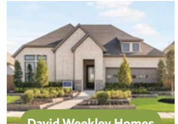
David Weekley Homes