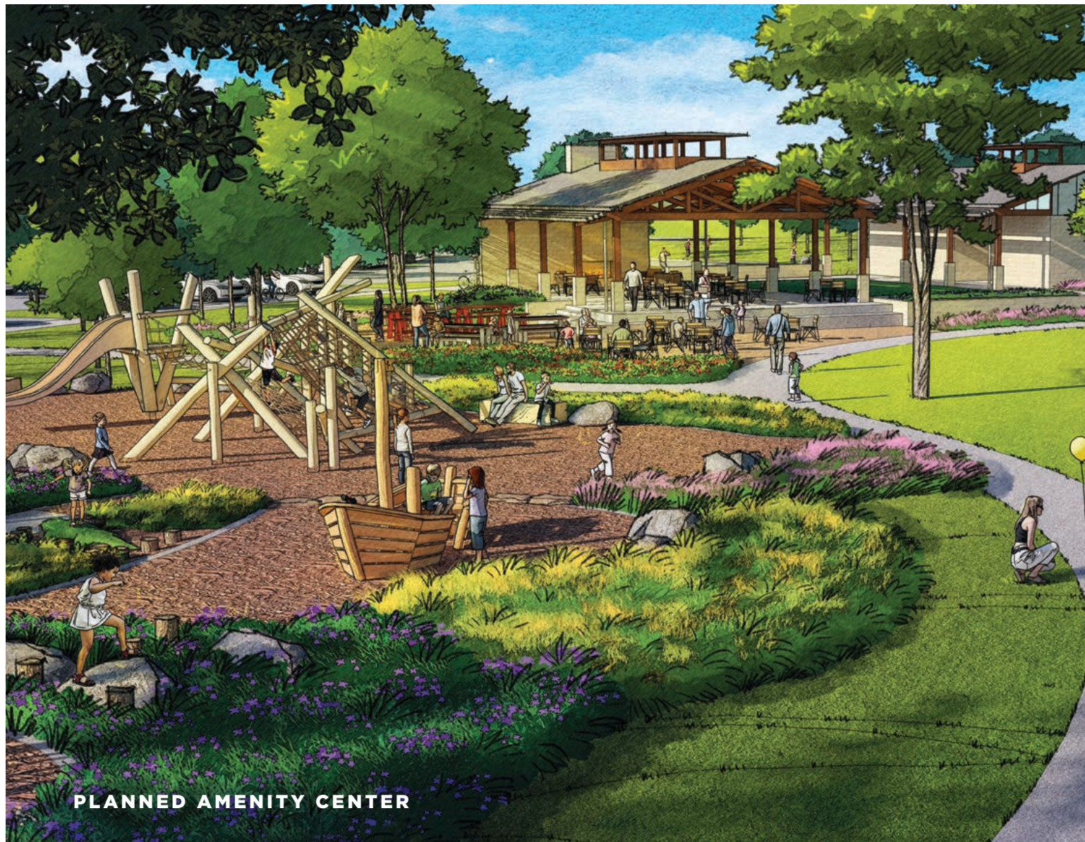
PLANNED AMENITY CENTER