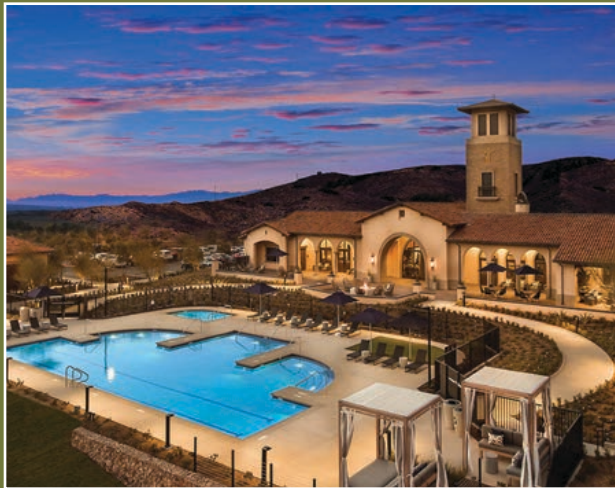
TERRAMOR - LOS ANGELES

In 2025 Starwood Land acquired 11 master-planned communities comprising more than 16,000 homesites and 600 acres of commercial property in three of the Top Ten largest U.S. new home markets - Dallas, Houston and Austin. Sunterra in Houston, a Starwood Land community, was the #1 selling community in Texas in 2023 and 2024.