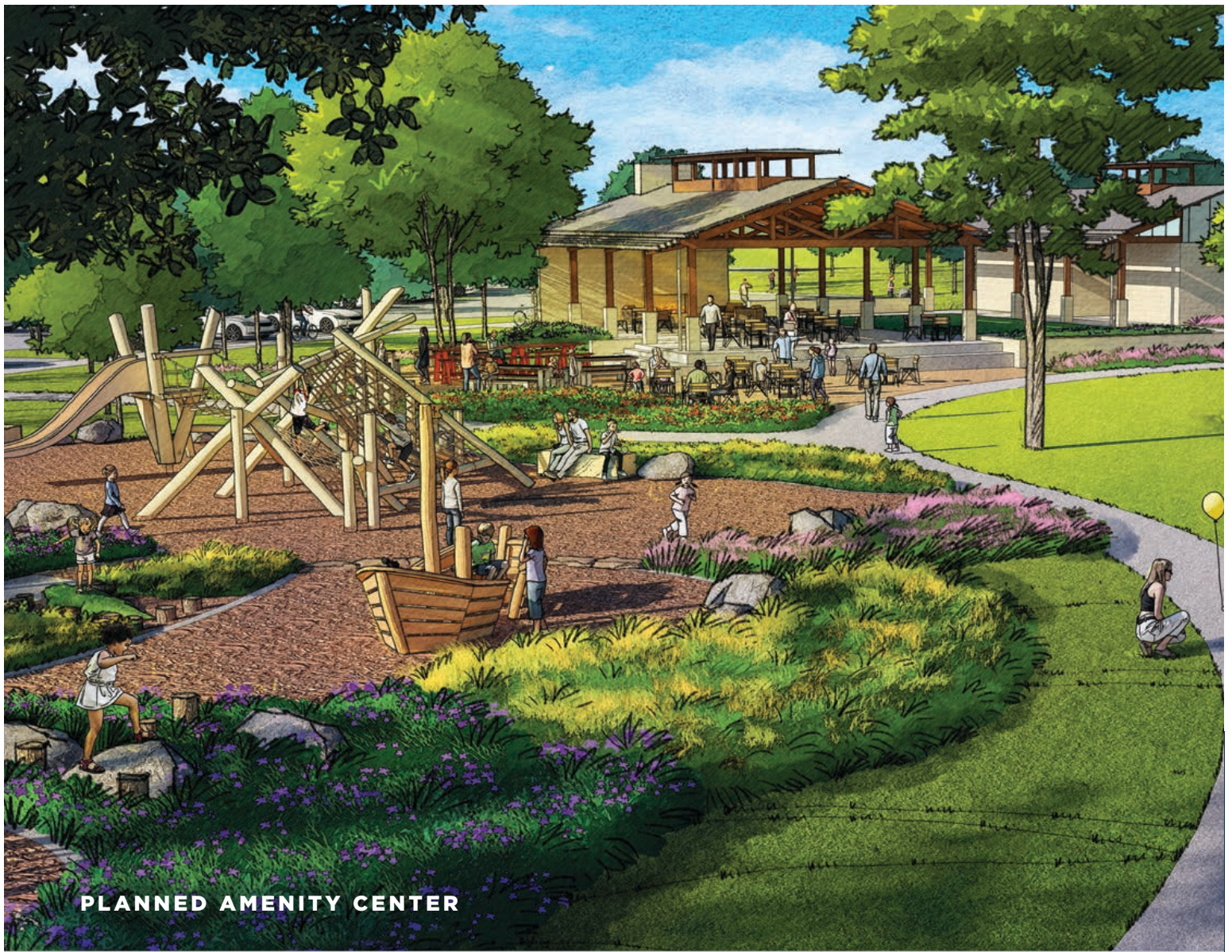
PLANNED AMENITY CENTER