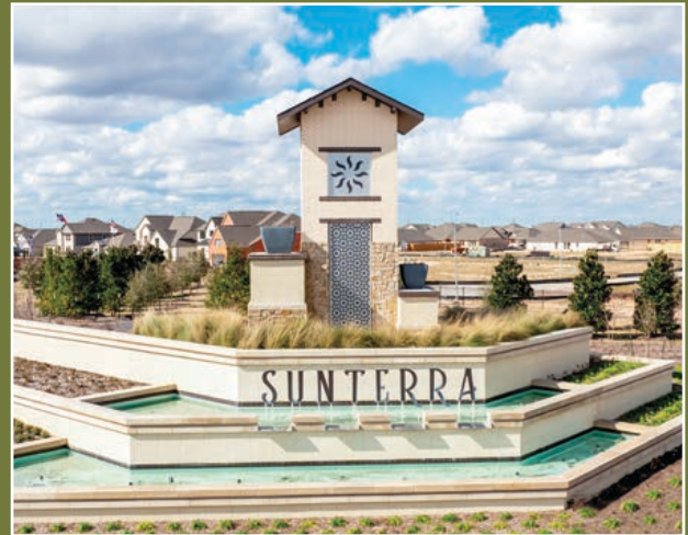
SUNTERRA - HOUSTON